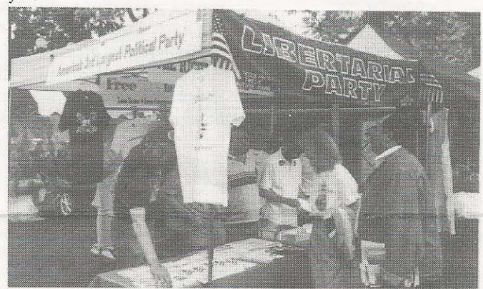
A busy day for Libertarians at the People's Fair

Special thanks are due to Larry Hoffenberg, who supplied the canopy and tables free of charge. And thanks to all the volunteers who staffed the booth – it wouldn't have happened, were it not for you!