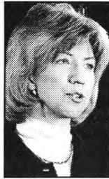
■ Norton: “Best possible” pick?