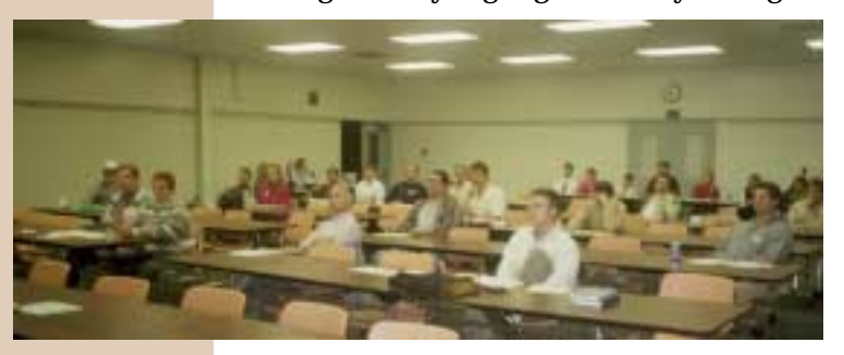
Members listen attentively at LPSCC quarterly Central Committee meeting

The LPSC Central Committee met on 4/12/01 at the Campbell Community Center, Roosevelt Redwood Room in Campbell. Considerable planning and effort had gone into making the meeting an early highlight of the year's agenda, by drawing an unusually large turnout to