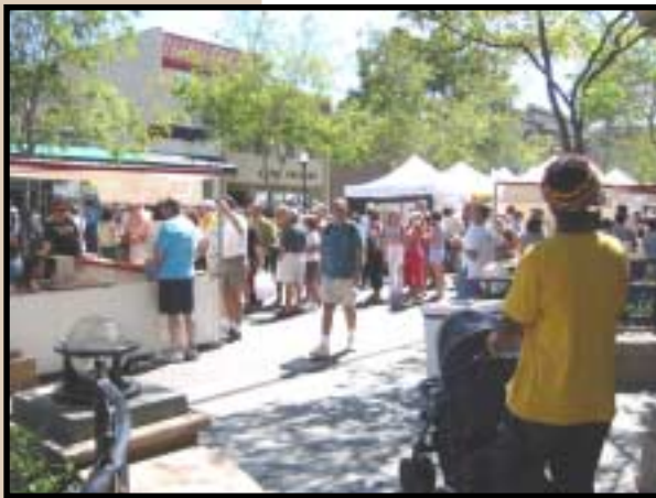
Crowd on Castro Street Not Far From OPH Booth

She continued by describing how our members can participate or just learn what's going on: "Visit the OPH web site at http://www.sc.ca.lp.org/lpsc-volunteer-oph.html to volunteer for a shift, or just to see the current status of which events are approved. Note that except for this weekend and next (Foothill Electronics Swap Meet), which we will do regardless of whether we get enough volunteers, our presence at all other events is *subject* to us getting enough volunteers. Of course, the shifts shown are not written in stone...if you have a different slot of time available, please let me know! You can also call me to volunteer or get more information: 650-938-1697."