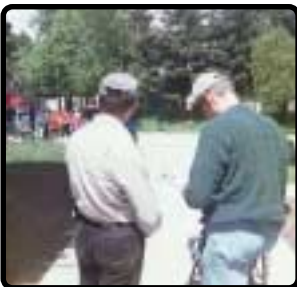
John signs him up!

FAQ: 1) Why do you need my help on April 20-21? We are all unpaid volunteers. No one person can collect 2000 signatures, but with enough volunteers who each collect a few signatures, we will make our goal! And with a concentrated effort on a single weekend, we can have a central headquarters where everything is prepared to make it easy for you. And finally, it gives us Libertarians a chance to meet each other, encourage new Libertarians in Mountain View, and have fun! 2) I can't make it for the April 20-21 petition drive, but I will have my family and friends in Mountain View sign the petition. 3) Then what should I do with it? First please make sure that each signer is registered to vote in Mountain View (no matter what party). Second, please make sure one of them observes each signature and signs the bottom of the petition as circulator.