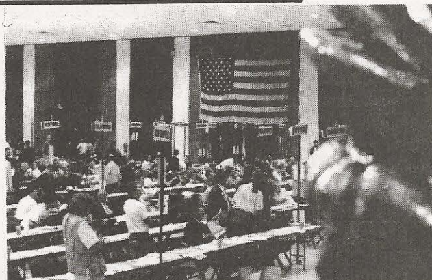
A view of the convention floor from just behind the large "Lady Liberty." Total attendance was over six hundred people.