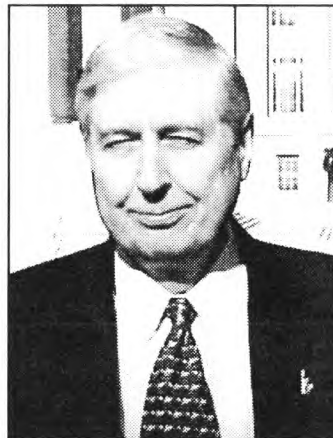
■ Browne: Vote totals were off from pre-election polls.

Around the country, Browne did best in Georgia, where he won 1.4% of the vote, Alaska (0.9%), Indiana (0.7%), Wyoming (0.7%), Colorado (0.7%), Idaho (0.7%), Massachusetts (0.6%), and