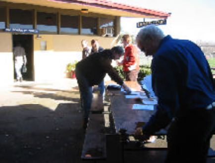
Moving as School of Choice Office is opened

Umphress suggested that LPSCC Convention attendees be warned that delegates to the LPC Convention will be required to pay $20/day to access the floor.