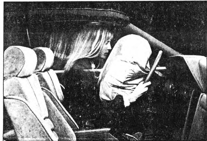
Chrysler Product Communications

This oxymoronic bit of irony echoed strongly in the recent announcement by the National Highway Traffic Safety Administration (NHTSA) that certain Americans will now be permitted to install on/off switches for