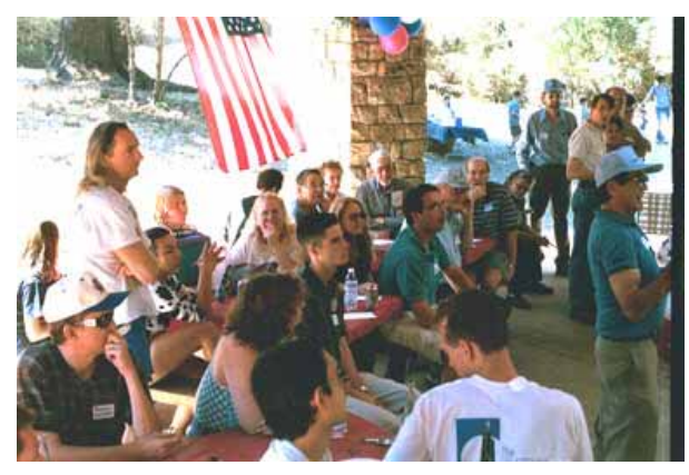
Audience giving rapt attention to one of many speakers