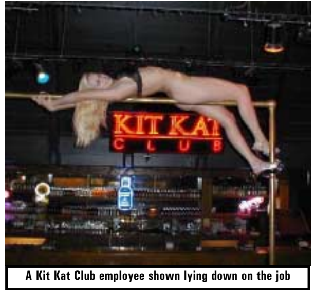
A Kit Kat Club employee shown lying down on the job