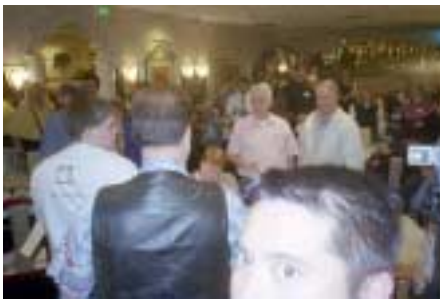
Members rise as meeting adjourns

In order to maximize the LPSCC's potential representation at the upcoming 2002 LPC convention on Presidents weekend (Feb. 16 - 17), a motion was passed authorizing all qualified members of the LPSCC to be alternates and to allow the delegates to determine the order of seating of these alternates at the LPC convention.