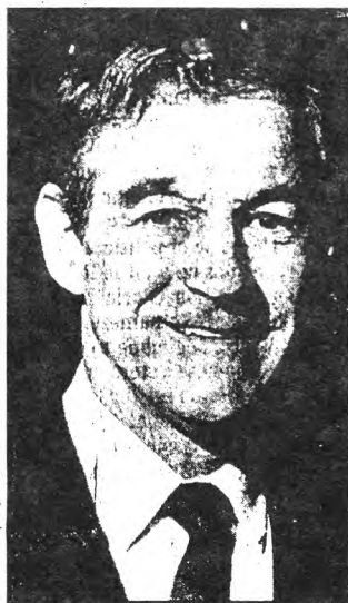
RON PAUL Party's White House hopeful

Paul, 52, an obstetrician, was a Republican congressman from Texas from 1976 to 1984 and joined the Libertarian Party in February 1987.