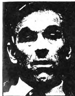
Libertarian presidential candidate Ron Paul speaks to a packed house in Turlington Hall Wednesday. Paul was in Gainesville as part of his Florida tour.

"The American people are totally frustrated. They're going to be turned off by what they're getting. This is an opener for us to explain our ideas."