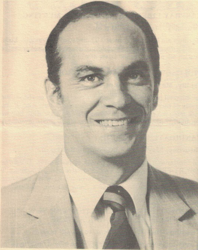
BILL WHITE U.S. CONGRESS DISTRICT 12

"People know better than government how to spend their own money."