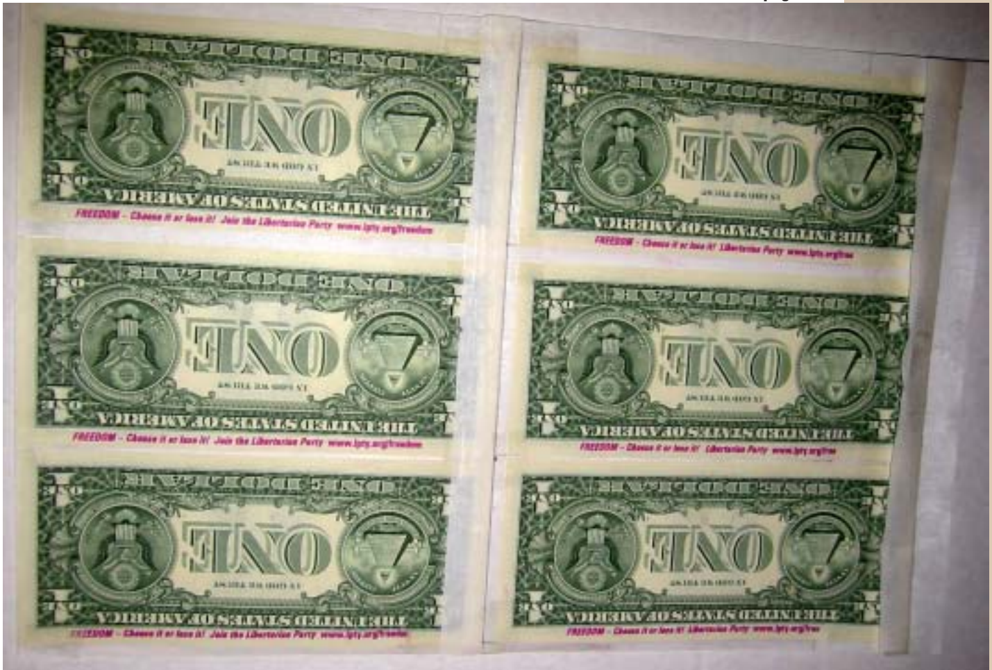
First successful ink jet printer 6-bill carrier. Note entry flaps covering bill ends at right of both columns. Ad is printed in widest margin They're not equal!