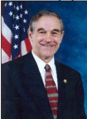
Congressman Ron Paul

Well-known Libertarian Presidential Candidate (1988) and current Congressman, the Honorable Ron Paul, will be giving our