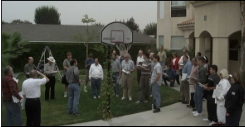
Forty Libertarians Volunteer in Bellflower