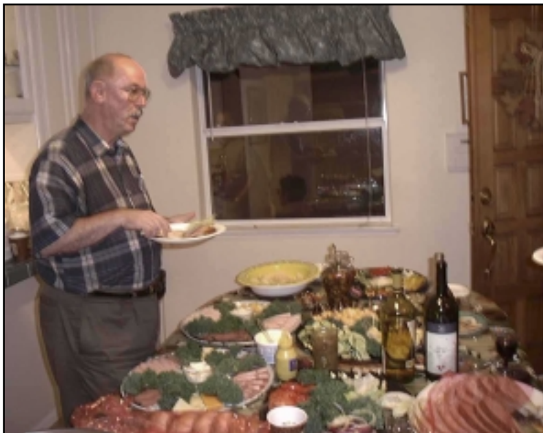
A Faboo Spread of Food and Cheer