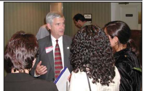
Judge Gray meets concerned members of the Bay Area Iranian–American Voter Association on July 11.